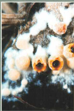
Fruiting bodies of the artillery fungus.

Penn State researchers have recently discovered that blending 40 percent used mushroom compost with landscape mulch greatly suppresses the artillery fungus. Mushroom compost, or mushroom soil, is the pasteurized material on which mushrooms are grown. After the final crops of mushrooms are picked, the used compost is pasteurized a second time and removed from the mushroom house. This valuable by-product (sometimes called "black gold") is often made available to gardeners and home-owners. Used mushroom compost has physical and chemical characteristics that make it ideal for blending with landscape mulch to enhance growth of horticultural plants. In addition, mushroom compost contains beneficial microbes that compete with, or actually destroy, nuisance fungi such as the artillery fungus and bird's nest fungi. Homeowners are increasingly interested in controlling nuisance fungi without the use of chemicals. Blending used mushroom compost with landscape mulch offers a "green" and environmentally friendly solution to reducing the harmful effects of the artillery fungus.