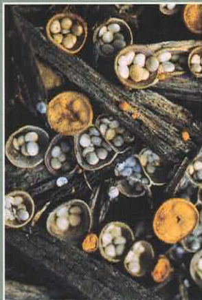
Bird's nest fungus ( Crucibulum spp).

These naturally occurring fungi decompose organic matter and do not need to be removed. They are interesting to look at—show them to children!