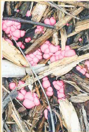
A fresh, brightly colored pink slime mold.