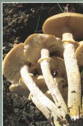
Many different species of fungi produce fruiting bodies called mushrooms.

Appreciate their beauty, ignore them, or remove them.