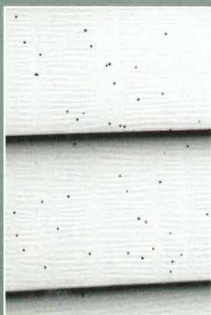
Artillery fungus spore masses on vinyl siding.