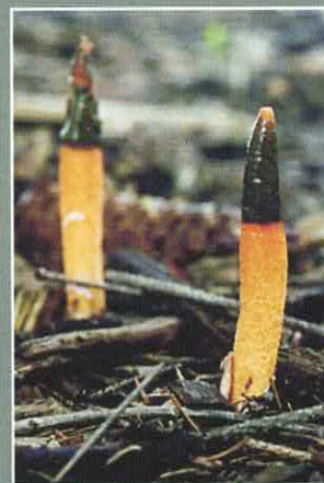
This fungus is called a stink-horn. It gets its name from the foul odor of the cap of the fruiting body.