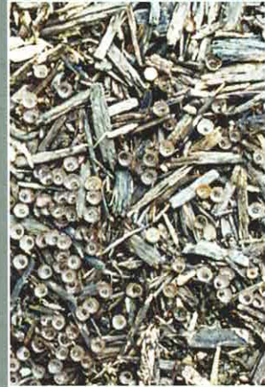
Bird's nest fungus ( Cyathus spp).